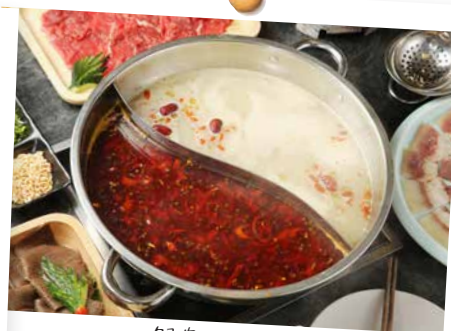
鸳鸯火锅 Yuanyang Hotpot