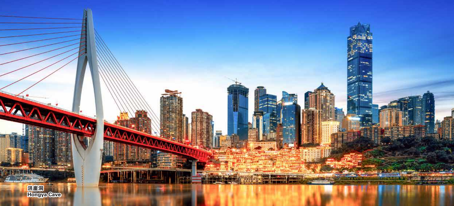
洪崖洞 Hongya Cave